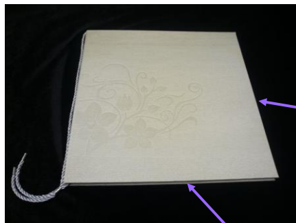
Guest Signature book

A: Yes, please see below picture. It is 40 pages and 31.5cm width x 31.5 cm length.