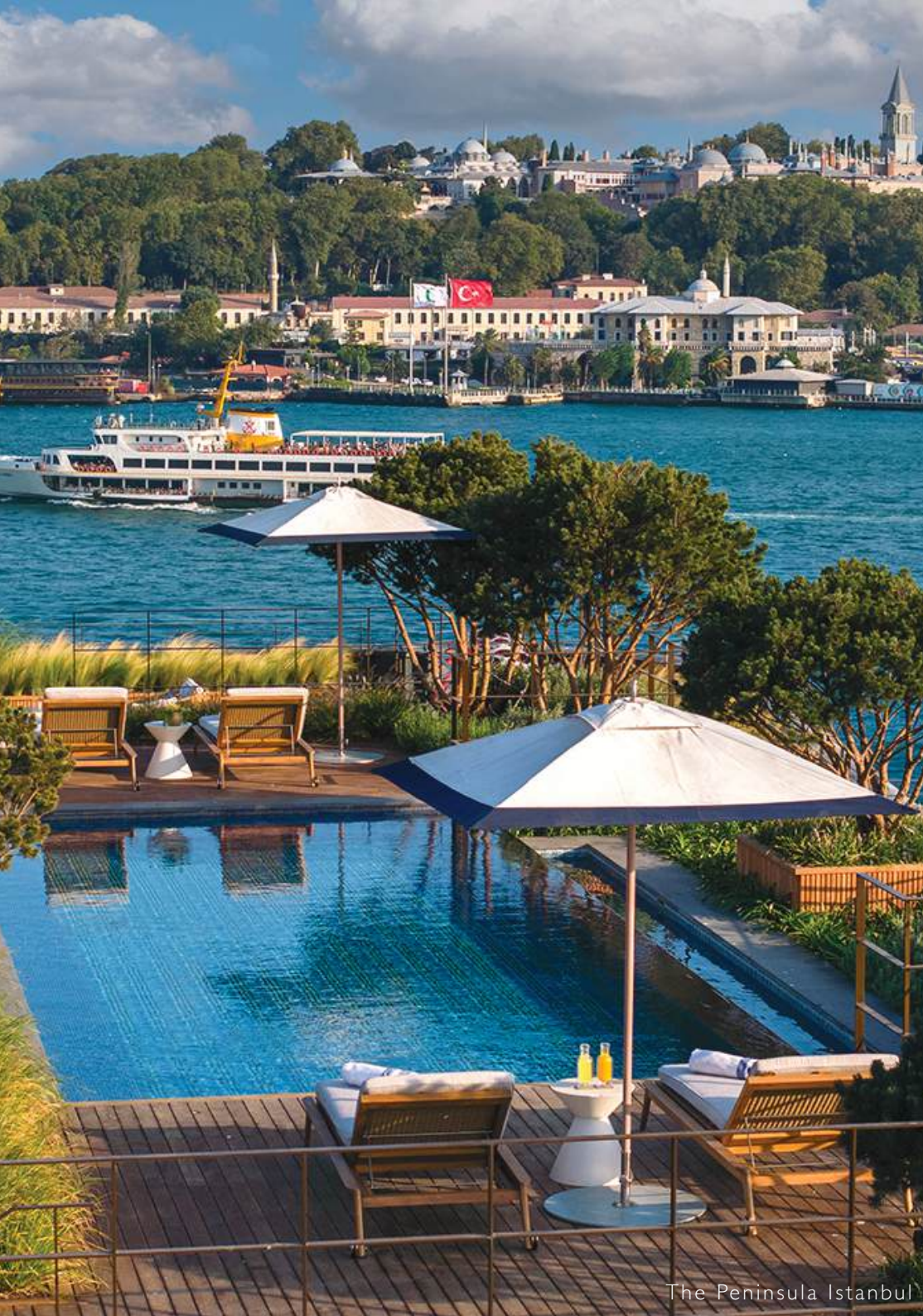
The Peninsula Istanbul

With a rich heritage dating back to 1928, The Peninsula is one of the world's leading luxury hotel groups, offering one iconic landmark property in 12 gateway cities — Hong Kong, Shanghai, Beijing, Tokyo, New York, Chicago, Beverly Hills, London, Paris, Istanbul, Bangkok and Manila.